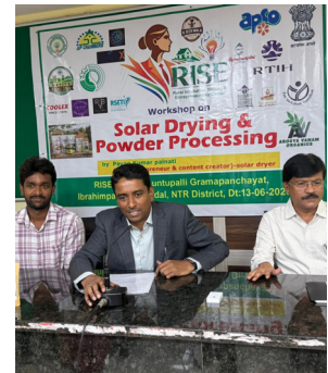
representatives of self-help groups, RISE Centre officials, and women participants from various communities.