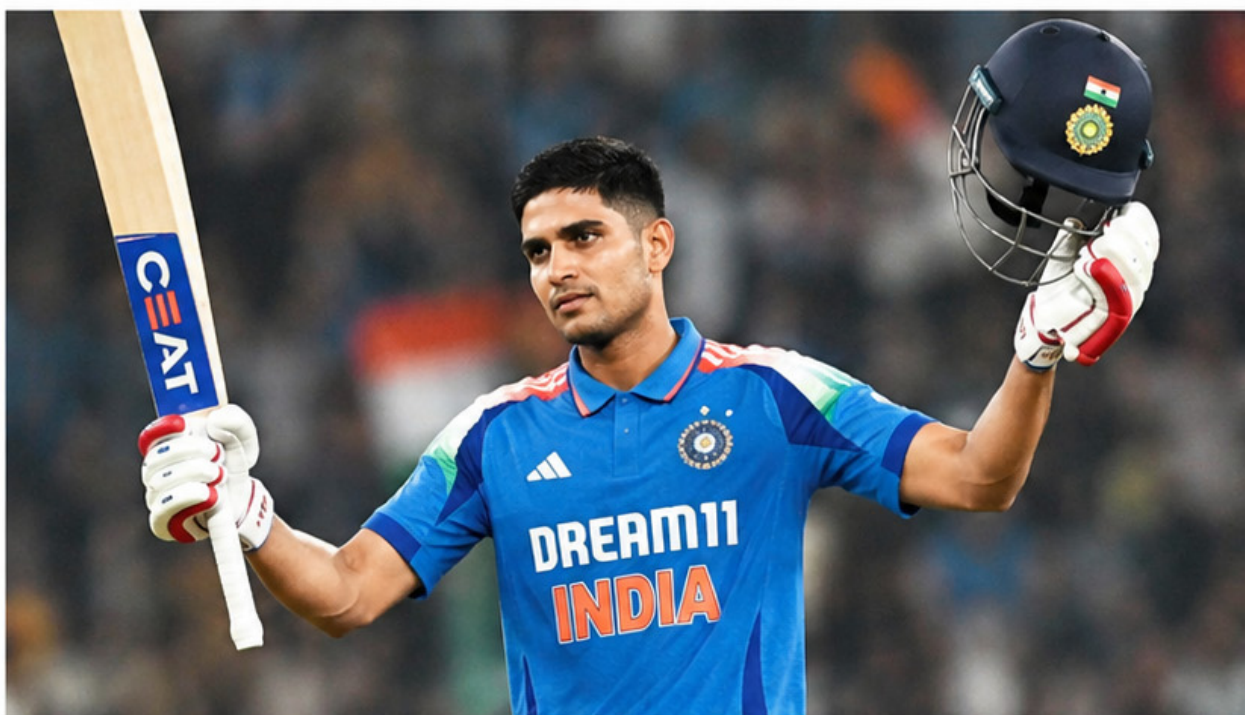
Shubman Gill scored an unbeaten 84 off 66 balls to guide India home.

The second ODI between India and Afghanistan will be played on June 16 at the same venue.